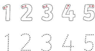
Number Tracing Worksheet

In maths, we will continue to focus on Numbers 1-5. The children will explore numbers by representing them in different ways. We will continue to cover number recognition and have a go at forming numbers. The children will count out different objects and recognise quantities by sight.